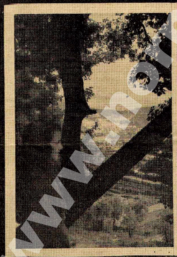
V As In Rendezvous