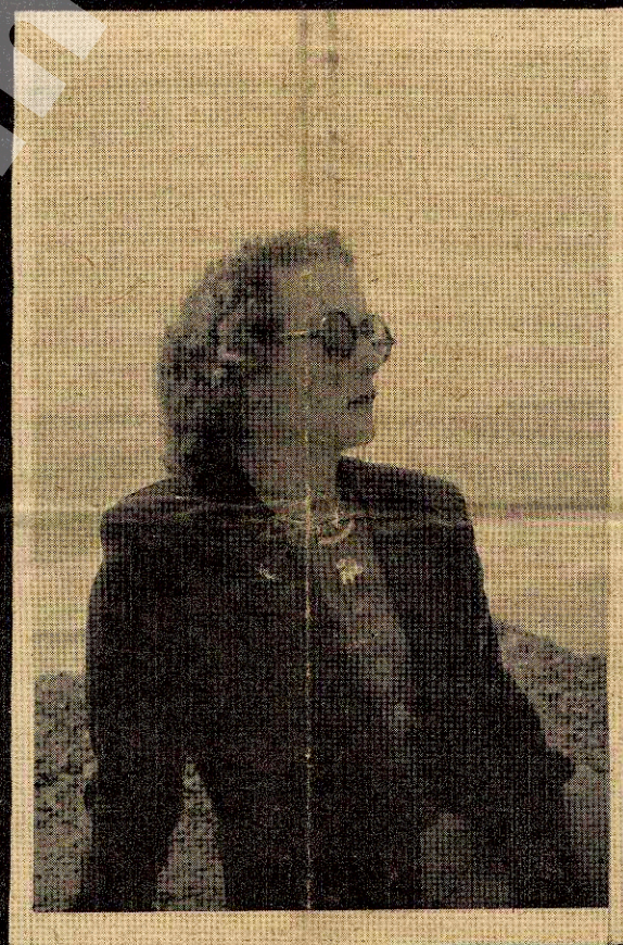
Olga From The Volga