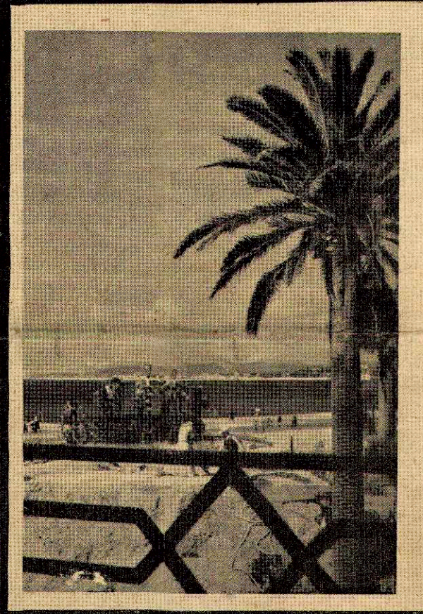
Just Like California