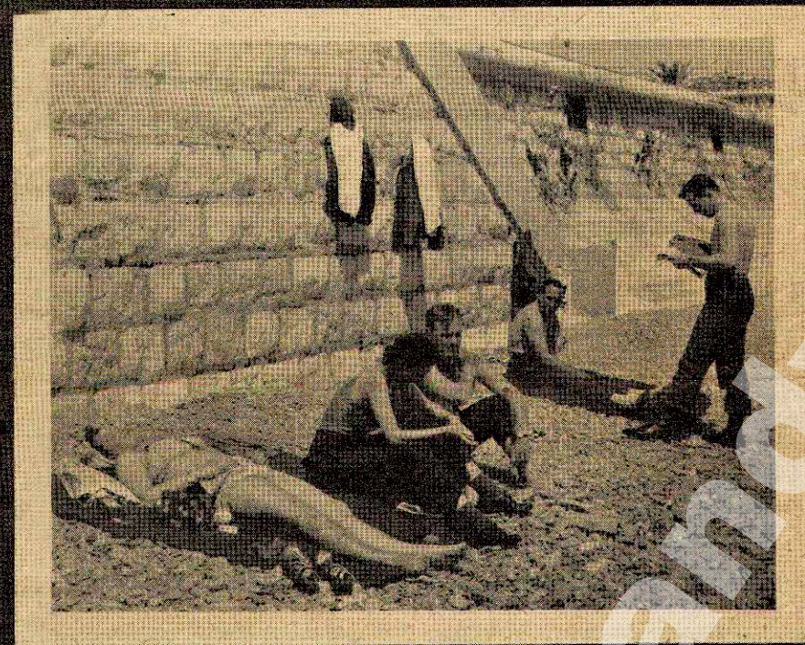
Wacs Relax, Too