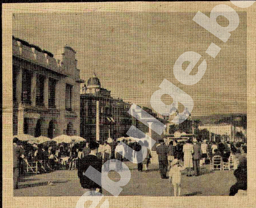
Red Cross Promenade - Nice