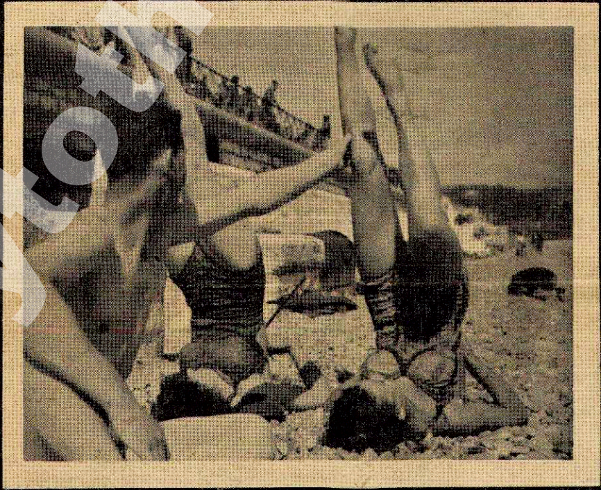
Fit For A Yank